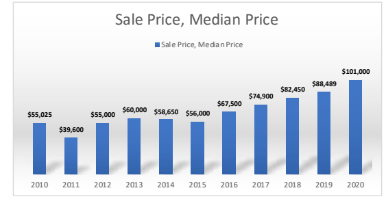
Figure 2. Median Sales Price (through December 31, 2020)